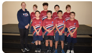
Year 5 Boys - 2nd Place