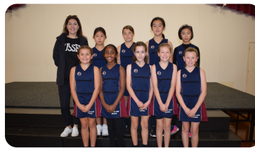
Year 5 Girls - 2nd Place