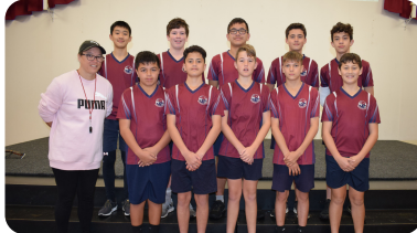
Year 8 Boys - 1st Place