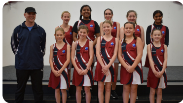
Year 7 Girls - 1st Place