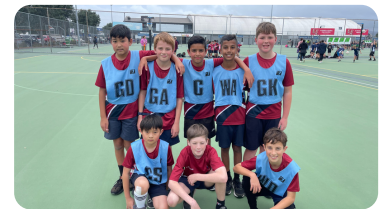
Year 6 Boys - 1st Place