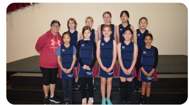
Year 6 Girls - 5th Place