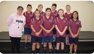
Year 7 Boys - 1st Place