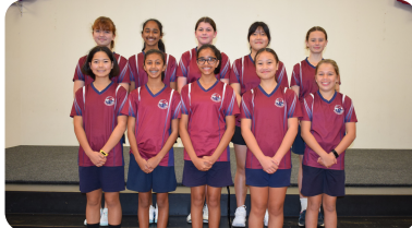
Year 8 Girls - 5th Place