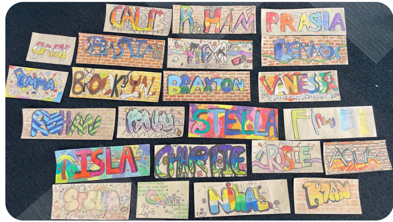
Room 23 Graffiti Art

Guest speaker from 'Attitude.org' who spoke to the Year 7 & 8 students on Friday 1st March about Hauora, as part of this term's Inquiry topic. Attitude's kaupapa is to support schools, communities and whānau to build Aotearoa's most resilient generation yet.