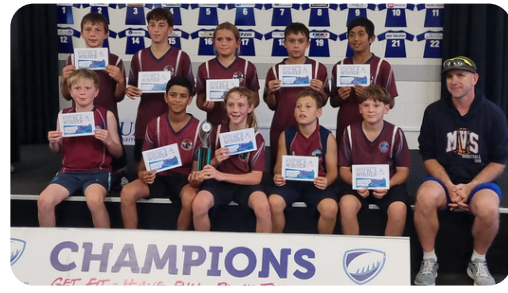
Year 7-8 Rag Tags