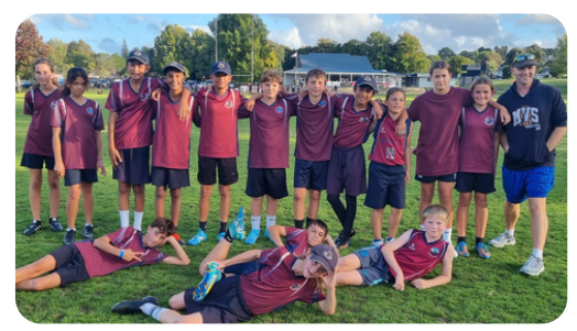
Year 7/8 Comets and Rag Tags