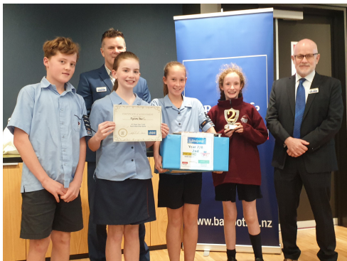
Second Place Year 7/8 C Team