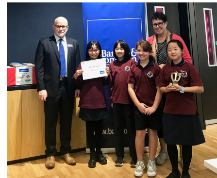
The Winning Year 5/6 C Team