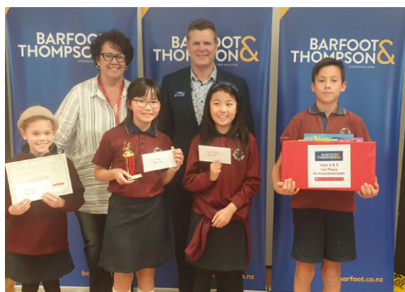
YEAR 5/6 TEAM B - 1ST PLACE