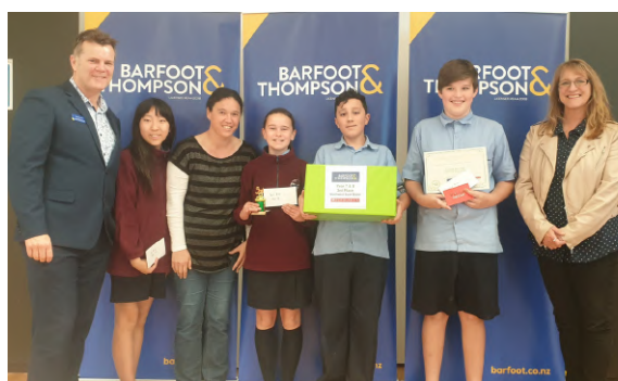
YEAR 7/8 TEAM B - 3RD PLACE