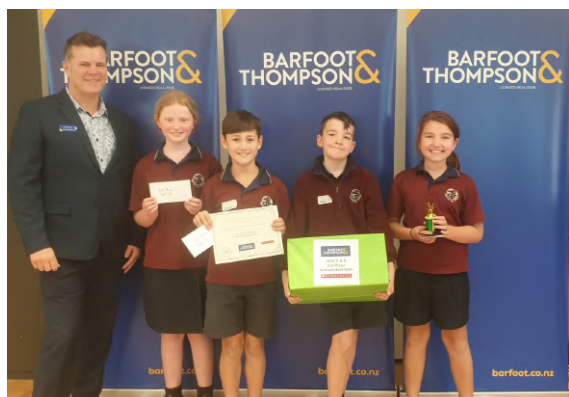
YEAR 5/6 TEAM C - 3RD PLACE