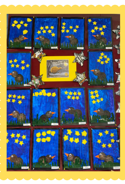
Room 10 learnt about little Kiwis' Matariki - here is our art.