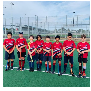
Year 5/6 Boys Hockey Team