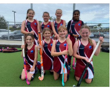
Year 5/6 Girls Hockey Team