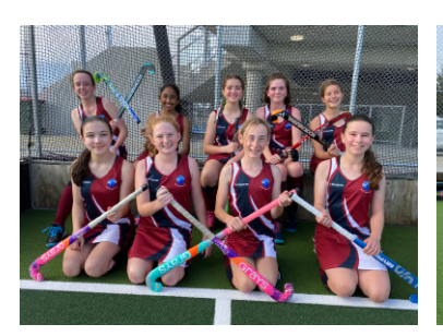
Year 7/8 Girls Hockey Team