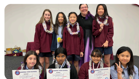
YEAR 7 FIREBIRDS