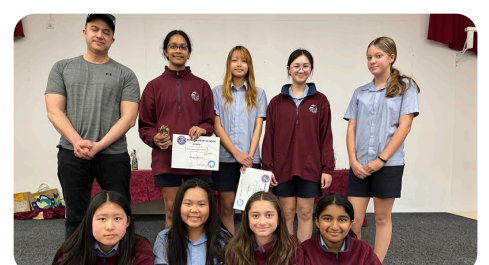
YEAR 8 SWIFTS