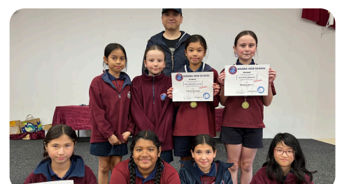
YEAR 6 THUNDER