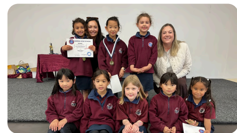
YEAR 1/2 MYSTICS