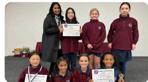
YEAR 5 THUNDERBIRDS