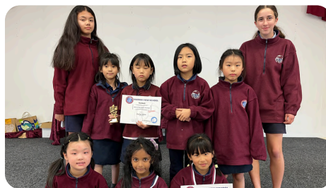
YEAR 3 MAGIC