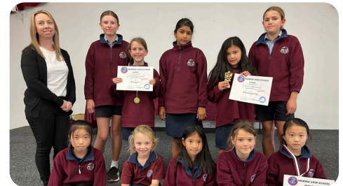
YEAR 3/4 EAGLES