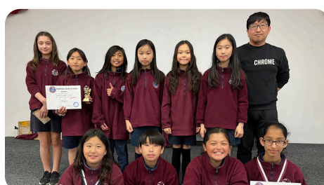
YEAR 6 RAINBOWS