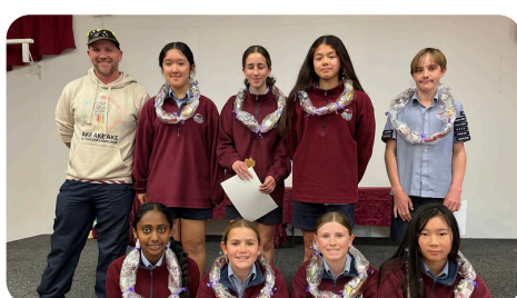
YEAR 8 COMETS