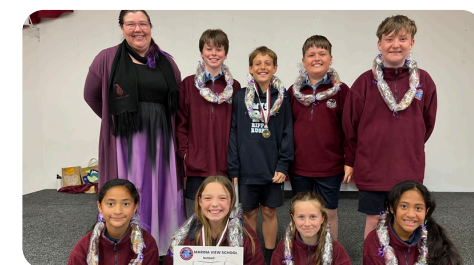
YEAR 6/7 STORM