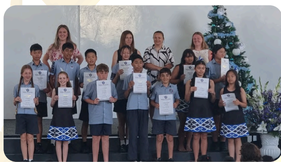
YEAR 7/8 CLASS AWARDS