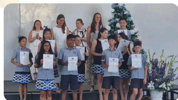
YEAR 7/8 CLASS AWARDS