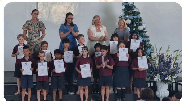
YEAR 3/4 CLASS AWARDS