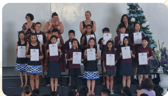
YEAR 5/6 CLASS AWARDS