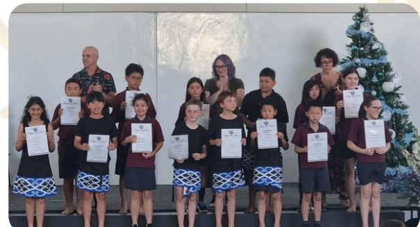
YEAR 5/6 CLASS AWARDS