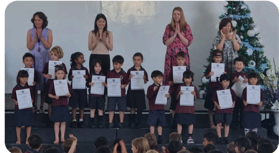
YEAR 1 CLASS AWARDS