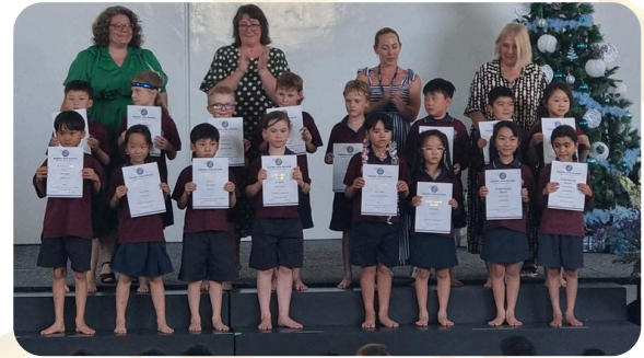
YEAR 2 CLASS AWARDS