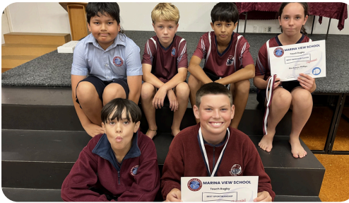
YEAR 7/8 WARRIORS