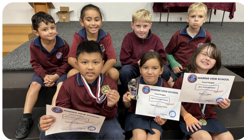
YEAR 3/4 HAWKS