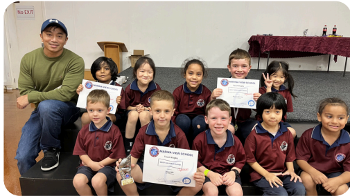
YEAR 1/2 WILDCATS

Touch will return in Term 4 of this year. Please keep an eye out on Hero for registrations late in Term 3.