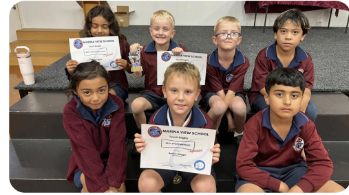
YEAR 3/4 VIPERS