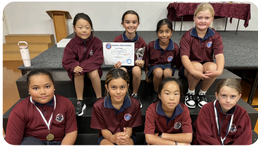
YEAR 5/6 ROCKETS